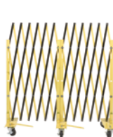
Portable Barrier Gate (Starter)