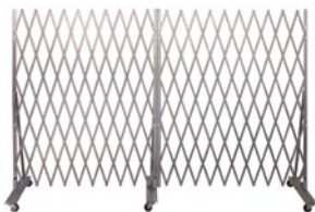
Portable Access Control Gate (Starter)

IEP Safety + Security Products are exclusively sold by IEP Authorized Dealers.