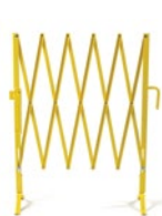
Portable Aisle Gate (Starter)